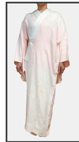
4. Juban (undershirt)