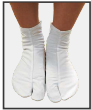
1. Ta-bi (socks)

Getting dressed by a professional Kimono dresser.